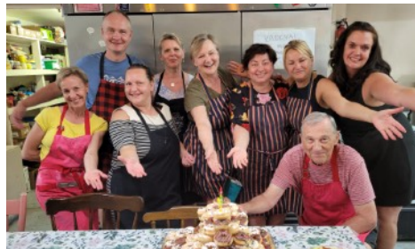
2023 Lithuanian camp "Kretinga" kitchen team

2024 CAMP "KRETINGA" English camp July 7th - 20th Lithuanian camp July 21st - August 3rd https:// form.jotform.com/ camp_kretinga/2024- Camper_Registration